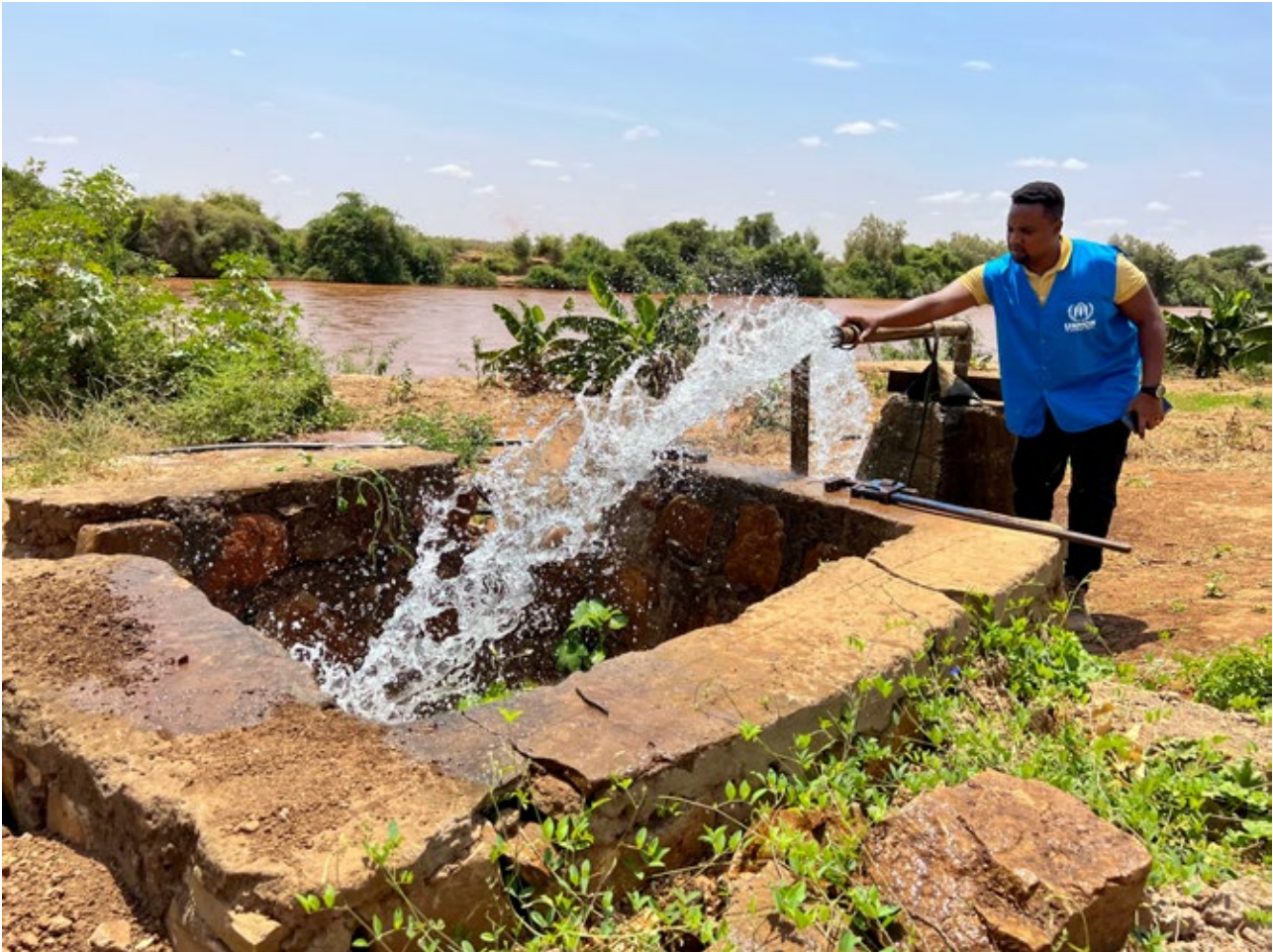
Photo: One of the boreholes that pumps water to Helaweyn refugee camp.

Thanks to this, we are already in a position to help provide life-saving support to thousands in need.